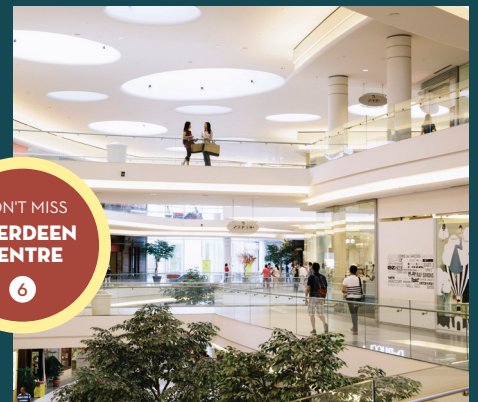
DON'T MISS ABERDEEN CENTRE 6