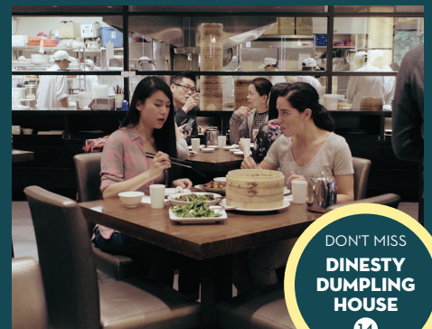
DON'T MISS DINESTY DUMPLING HOUSE 14

FOR MORE INFORMATION, VISIT US ONLINE VISITRICHMONDBC.COM OR CONTACT info@tourismrichmond.com