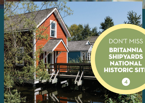
DON'T MISS BRITANNIA SHIPYARDS NATIONAL HISTORIC SITE 4

Weave back to where the bus dropped you off and hop aboard any service: they all head to Richmond-Brighouse Station . Reconnecting to the Canada Line, hop off at Templeton Station's McArthurGlen Designer Outlet 5 , with its 70+ designer discount stores (1 hour).