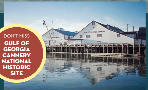
DON'T MISS GULF OF GEORGIA CANNERY NATIONAL HISTORIC SITE