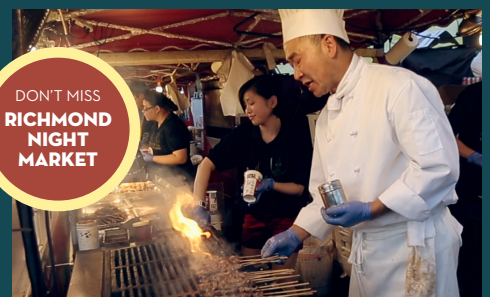
DON'T MISS RICHMOND NIGHT MARKET